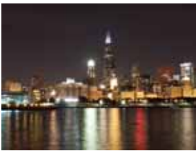
Conveniently located and presented near the Chicago O'Hare Airport

Currie Management Consultants is offering its popular Achieving Service Profitability seminar series directly to equipment dealers.